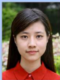
Background not plain