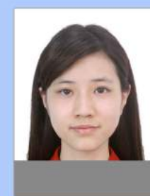
Damaged photo or other defects