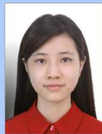
Shadows on background