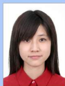
Hair covering eyes, eyebrows or ears