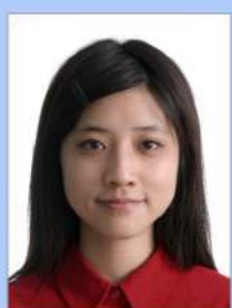
Shadows on face