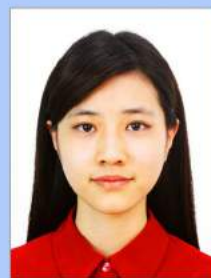
Contrast too high