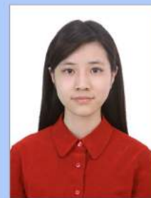
Head too small