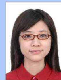
Frame too thick