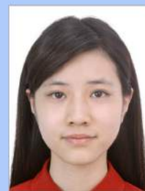
Head too big