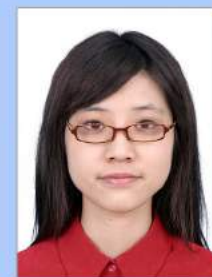
Frame covering eyes