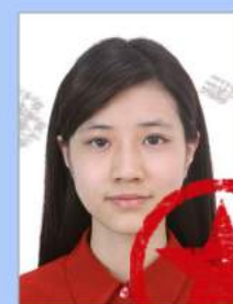
Stamp or other patterns on photo