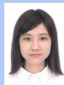
Clothes color identical to background