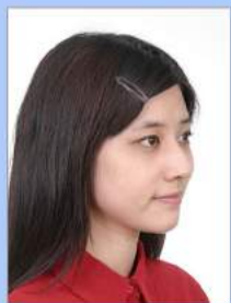
Not facing camera